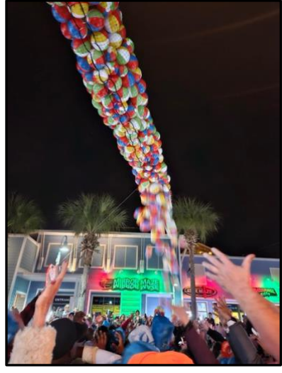
"Let Them Drop!"

PCB sure knows how to throw a New Year's Eve party and The Women's Civic Club of PCB was delighted to have been a part of it! We were tasked with handing out 15,000 party hats to the party goers at Pier Park. And we were amazed at the number of folks that came out to ring in the new year with their families and friends.