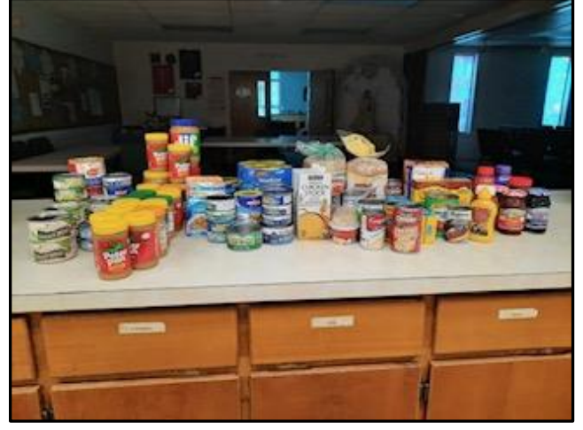
December Luncheon Meeting Collections